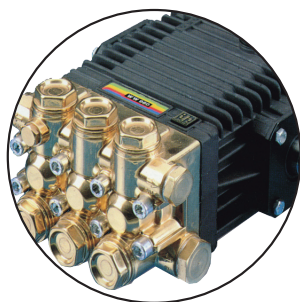
Interpump 44 Series

Kingfisher Direct Ltd Retford Enterprise Centre Retford Nottinghamshire DN22 7GR 01777 858009 Company Reg No: 07752788 VAT No: 120941249 info@kingfisherdirect.co.uk