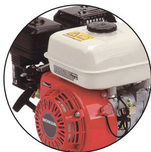
Honda GX200 Engine

*Net power @ 3600 Rpm in accordance with SAE J1349