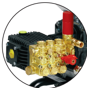
Interpump 63 Series