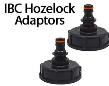
IBC Hozelock Adaptors